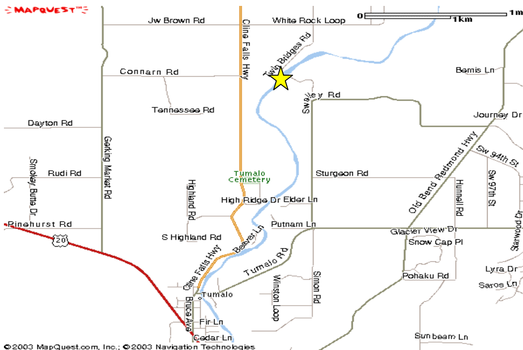
Map to Outing