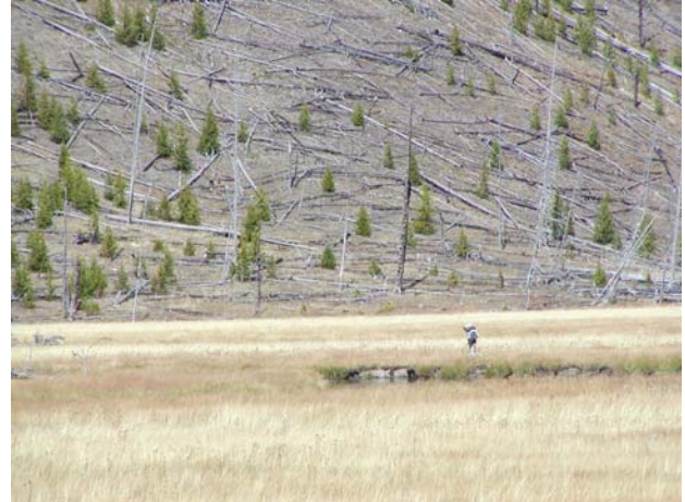
Fishing the Firehole

fisherman at every pullout. However, if you