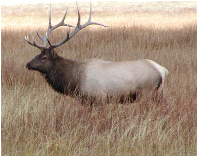
A Curious Potential COF Member by the River

I also had a lot of good experience with wildlife. While fishing upstream on Soda Butte Creek, for some reason I turned and looked downstream. On the path trotting up to me was a large, very blond coyote that stopped about six feet from me. We looked at each other for about a minute, he decided that I was too old to chew, and trotted around me on his way up the river. The elk and particularly the buffalo, along with deer and trumpeter swans, seem very curious about fishermen and come over to see how the fishing is. I often found myself way out in a meadow surrounded by wildlife while being photographed by sightseers from the road a quarter of a mile away. Why they don't walk down into the meadow, I don't know.