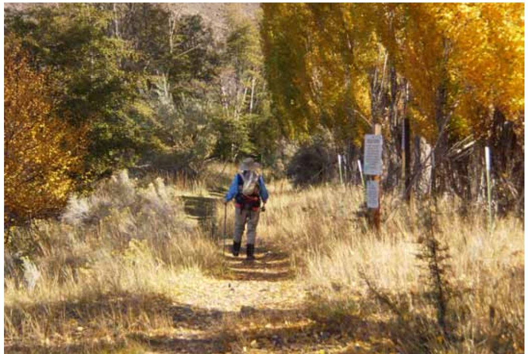
Fall fishing along the Deschutes River.