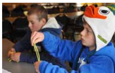
Kokanee Karnival Angling Clinic at Shevlin Park, April 2013.