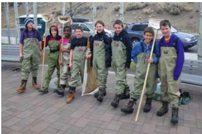
REALMS students in COF waders – ready for the river.

Next Cast Flyfishers is offering a summer fly-fishing camp through Bend Parks and Recreation. The camp will be June 18, 19, and 20, from 9:00 A.M. to 1:00 P.M. each day. The curriculum will also include knot tying, fly tying, bug collection and identification, casting and fishing in the ponds each day. The camp is listed in the Bend Parks and Recreation summer catalog to reach all of the area youth.