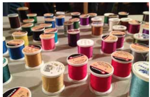
Rod-building class—colorful, creative and fun.