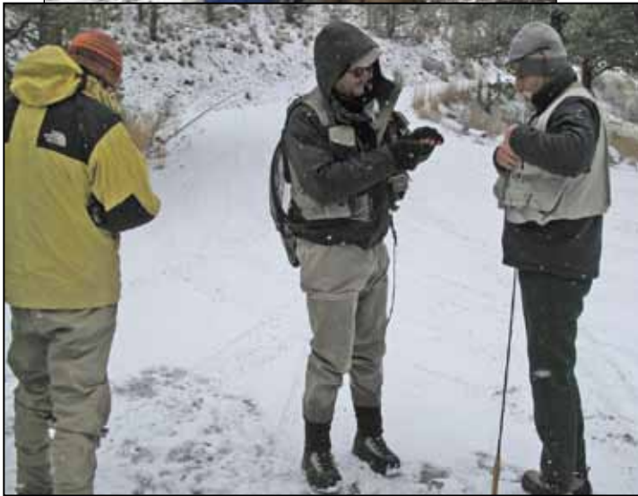
Snowy weather didn't deter hearty anglers from fishing the Crooked River on February 11.