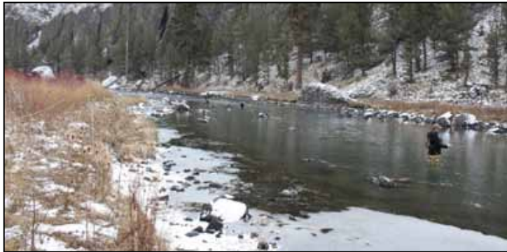
Crooked River outing, February 11, 2009.