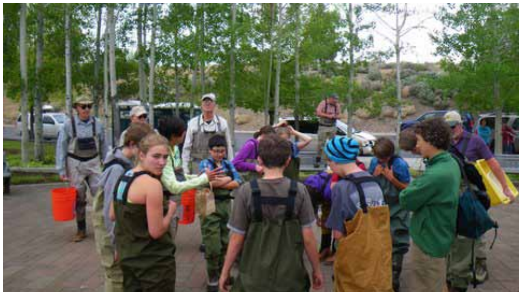
Upper Left: REALMS students return from collecting bugs in the Deschutes River. Upper Right: Student with a sample of a stonefly and other nymphs. Bottom: Students in waders.