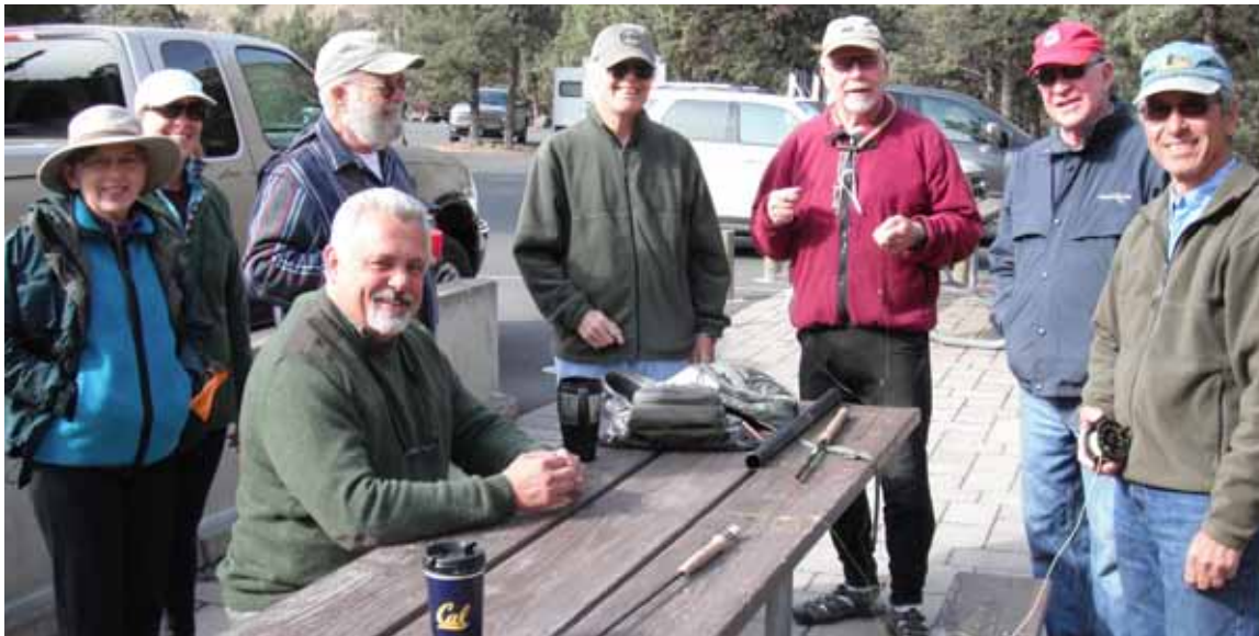
COF members on the Crooked River outing in May.

Wing: white or gray antron or Zelon or gray CDC or pearl Krystal Flash