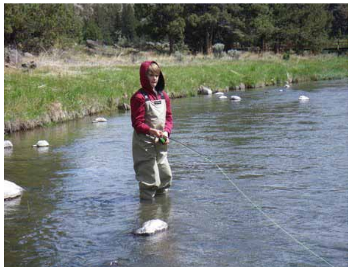
Student from REALMS on the Crooked River.

FOR SALE: Humminbird fishfinder 150. Used a total of six hours. $40. Contact Tom Philiben (541-390-8179)