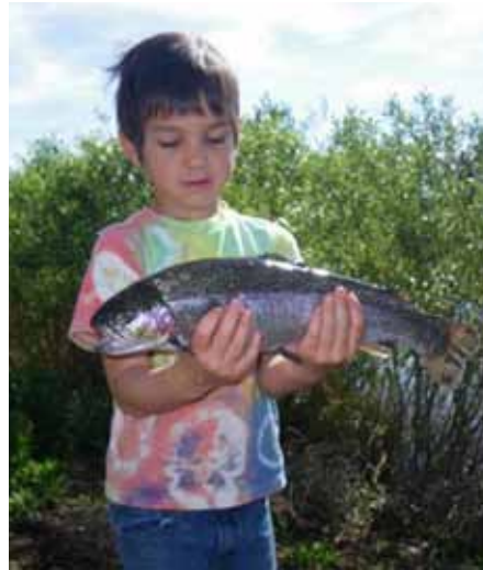
Little person catches a big fish at Bend Pine Nursery Pond during youth angling event in May.

– Jen Luke, ODFW STEP Biologist (541-633-1113)