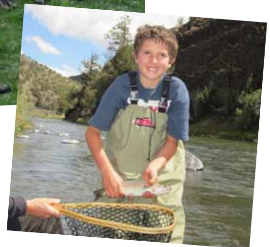
Students from REALMS on an outing to the Crooked River in May.