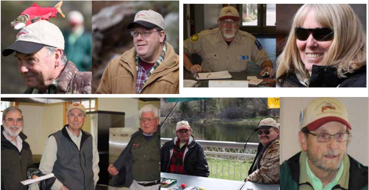
Kokanee Karnival volunteers have as much fun as the kids.