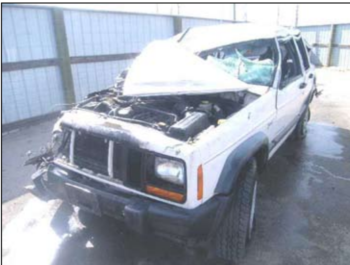
Jerry's car (or what remains of it) after hitting a patch of ice and rolling multiple times.

This fly is easy to tie; keep in mind you need room at the hook eye to raise the wing and veiling. Attach the tails and spit, remembering to keep them a little long. Tie in the biot and bring it forward in neat, even wraps, stopping with a good gap to the hook eye. If dubbing the body, keep it slim and tight as you bring it forward. Tie in the top end of a mallard or partridge feather that has a "V" cut in the tip. (Cut out the tip itself.) Tie it in facing forward over the hook eye. Select 4 or 6 CDC feathers and tie them in over the partridge, facing the same direction as the veiling. Dub a small amount and cover the butt ends of the wing and veiling materials. Bring the thread forward and raise the wing and veiling into an upright position; begin winding the thread to hold them in position. Add a little dubbing to finish the head off with a neat look.