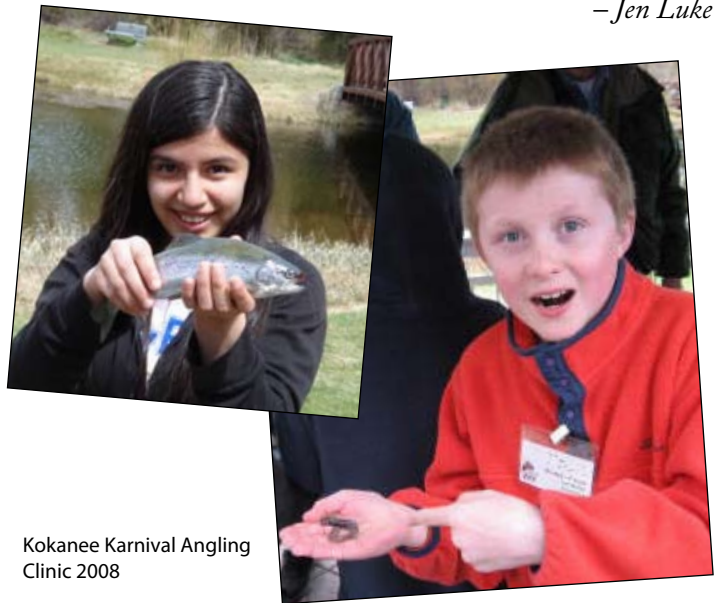
Kokanee Carnival Angling Clinic 2008