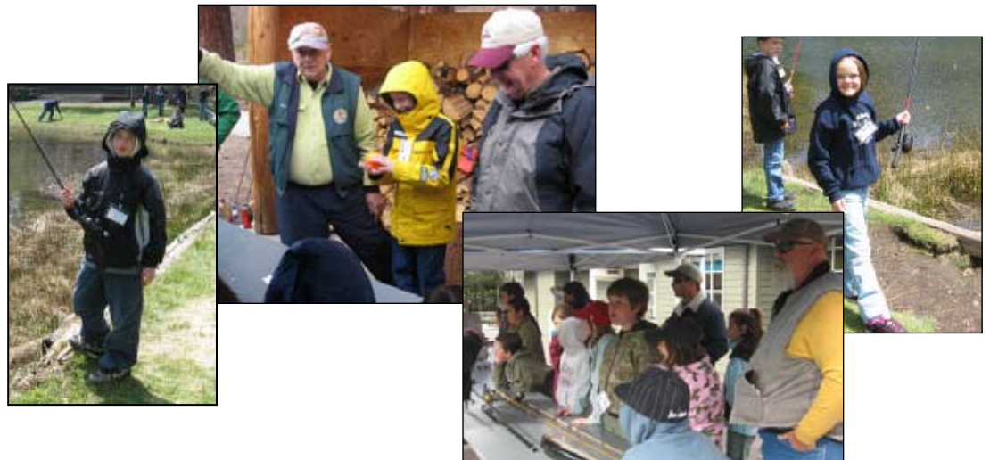
Kokanee Karnival Angling Clinic 2008