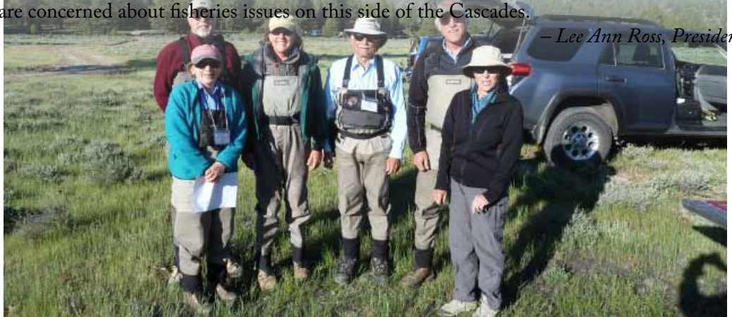
Outing to the Chewaucan River, June 2011.