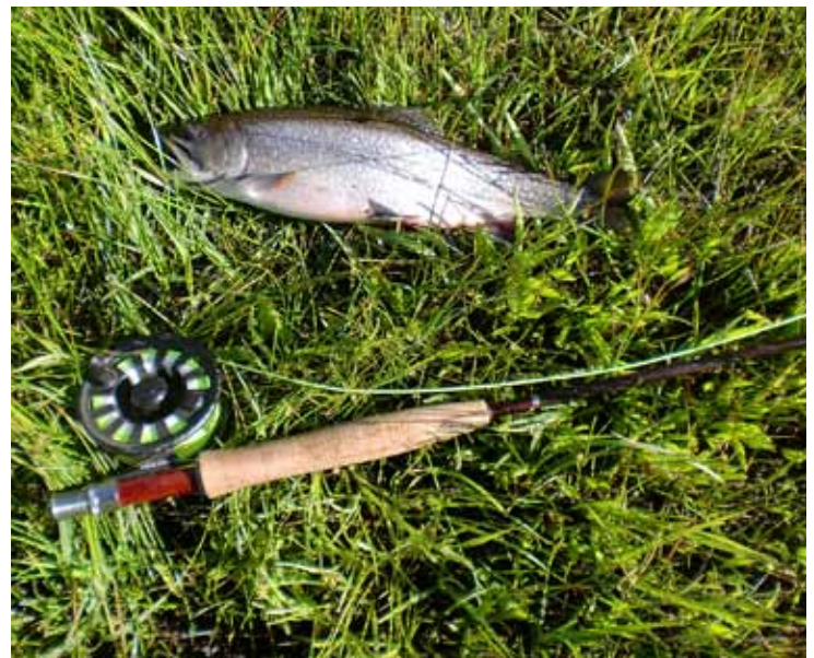
One of the few fish caught on the Chewaucan River during the June outing.

COME ON OUT FOR A DAY OF FUN, FLIES & FOOD!