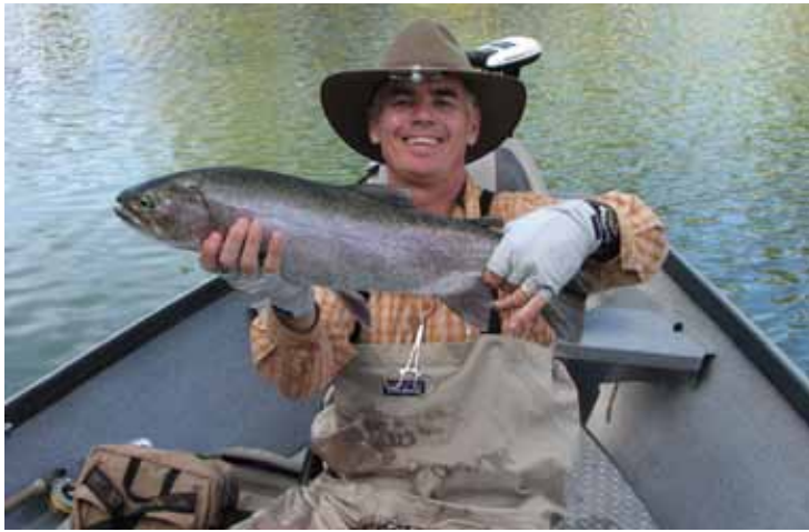
Here's a 27-inch fish from that day caught on the Williamson River.