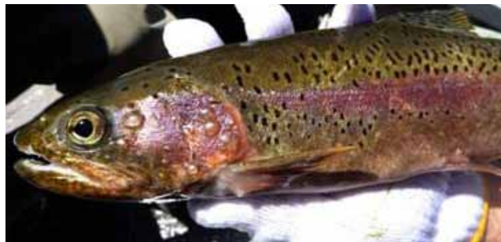
The Central Oregon Flyfisher

to cause gas bubble disease in the Crooked River below Bowman Dam. The gas saturation in the Crooked River is equivalent or higher than levels shown to produce gas bubble disease (GBD) in fishes. When flows exceed 600 cfs, the total dissolved gas saturation exceeds the maximum Oregon Department of Environmental Quality mandated level of 110% gas saturation in the Crooked River. Flows in excess of 600 cfs are common during spring runoff events below Bowman Dam. From 1989-2009, flows exceeded 600 cfs in 13 of the 21 years and 1000 cfs in 10 of the 21 years. The past population effects of high flows and supersaturated waters on redband trout and mountain whitefish are difficult to quantify, but based on the hydrograph and the saturation curve, the years when gas bubble disease might have been present in fish can be predicted. Given the strong linear relationship between TDG and stream average daily discharge ( r^2 = 0.93 ), discharge itself can be used as a predictive tool for assessing TDG levels in the river. Based on the flow data from the USBOR gauging station and the gas saturation curve for the wild and scenic section of the Crooked River generated here, gas bubble disease was probably present in fish in 1993, 1996, 1997, 1998, 1999, and 2004. The redband trout population