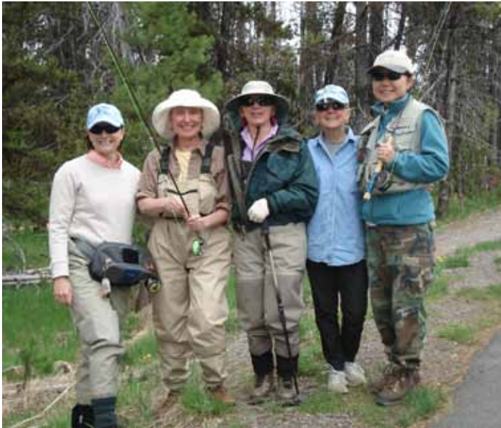
Wild Women of the Water on the upper Deschutes.