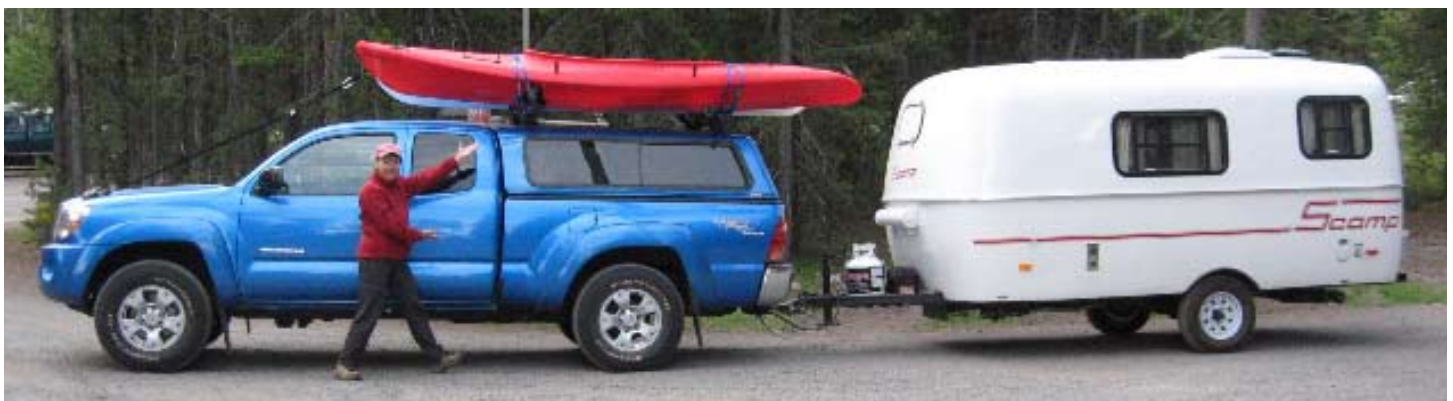
Delores with Lil' Redband and Bluebird.