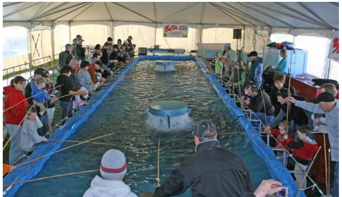
Kid's fishing pond at the Sportsmen's Show, 2010.