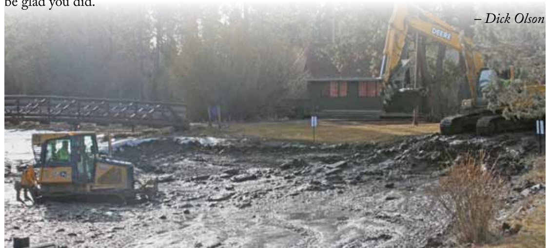
Dredging Shevlin pond to remove silt and improve fish habitat.