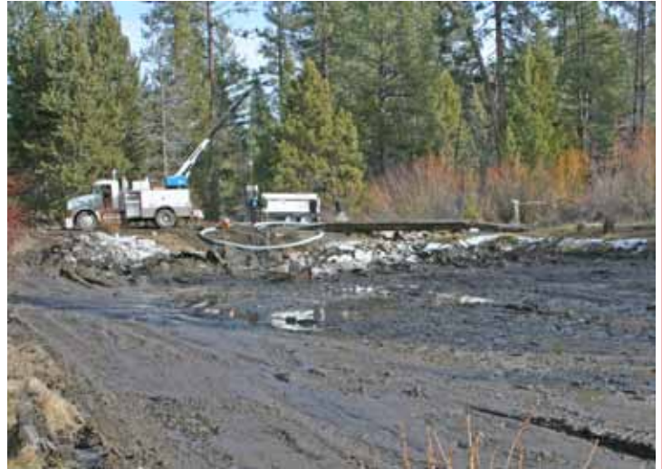
Dredging the outlet at Shevlin pond.

Membership application available from: http://www.coflyfishers.org