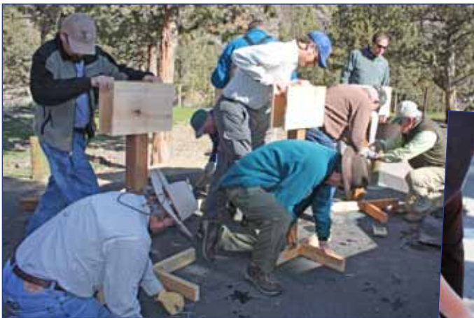
COF members, with assistance from Prineville High School students, assembled and placed educational signs along the Crooked River.