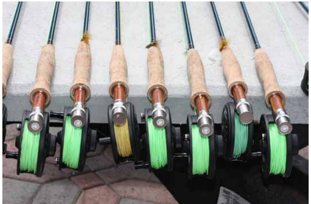
Rods and reels used by the Next Cast Flyfishers during three-day fish camp in Shelvin Park.