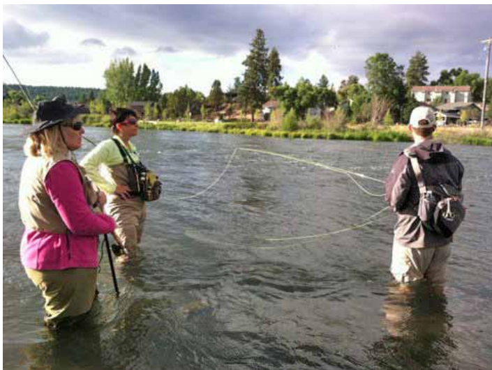
Wild Women on the Deschutes River.