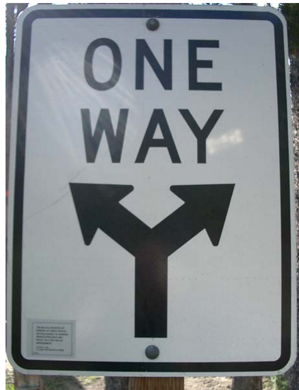
A Sign for Contemplation at Cinder Hill Campground, East Lake

When the hatch is on, you are own your own, although callibaetis seem to be the most common and emergers work better that straight dun patterns. However, you need to watch out for mixed hatches, because although the callibaetis are always prolific, they are not always the insect of