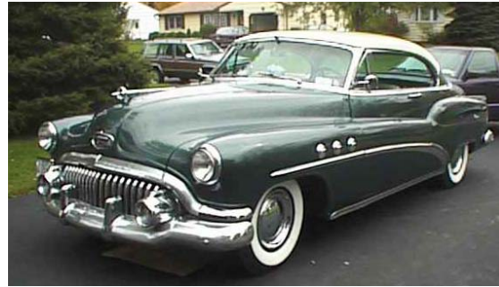
52 Buick, Alternate Tie

Dub seal fur on to your thread and wrap the dubbing towards eye of hook, leaving enough room for the head of the fly. Wrap your oval ribbing over the seal fur and trim. Tie in another set of guinea fowl tips for the beard. Guinea tips should extend to the hook point. Tie in a strand of peacock herl, make 2 or 3 wraps, tie off, trim, and whip finish.